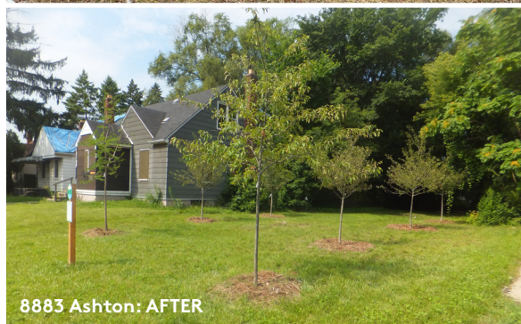
8883 Ashton: AFTER