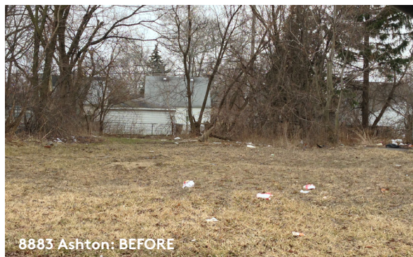
8883 Ashton: BEFORE

The Warren/Conner Development Coalition and RecoveryPark are project partners. Lawrence Technological University (LTU) will provide project guidance and construction project monitoring. All property utilized in this project will be publicly-owned in collaboration with the City of Detroit and the Michigan Land Bank. The Greening of Detroit will be the not-for-profit contractor for the vacant lots in the LEAP area. The DFC implementation Office will provide strategic leadership to ensure coordination with the DFC Framework and other new and ongoing initiatives in Detroit.